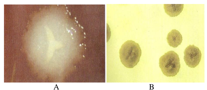
Figure-2. Colony morphology of an A. actinomycetemcomitans strain on A. specific medium, and B, a nonspecific medium. The internal star is easily seen

actinomycetem comitans reside in the 12-kb flp operon that contains 14 genes flp-1-flp-2tadV- rcpCAB-tadZABCDEFG. The transcription - initiation points of the operon were located at 101 and 102 nucleotides upstream of flp – 1