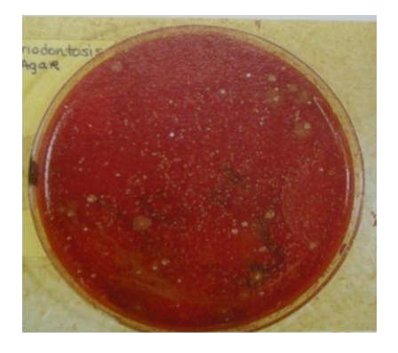
Figure 1 : Photograph of a primary isolation plate of a sub gingival plaque sample from a diseased site from a subject with LJP. The majority of small round convex colonies on this plate are isolates of A. actinomycetemcomitans

The rough colony morphology and the tight adherence (autoaggregation phenotype) have been attributed to the presence of long and bundled fimbriae on the cell surface. Colonies of the smooth variants lack the star like inner structure and the cells do not express fimbriae. <sup>[16]</sup> The non fimbriated smooth colony variants grow as large, round opaque colonies on agar.