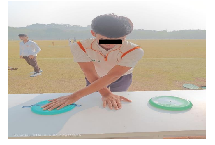
FIGURE 1) Evaluation of speed using plate tapping test