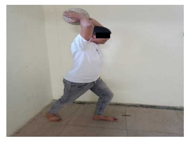
FIGURE 2) Overhead Soccer throw: