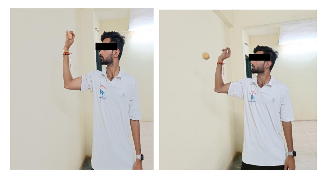
FIGURE 4) Bounce a weighted Ball: