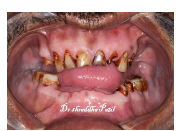
Figure1: Pre-operative view

severe attrition with brown discoloration of all teeth (Fig:1), attributed to a 30-year habit of areca nut chewing. Extraoral examination showed signs of a lost occlusal vertical dimension (OVD). The patient's chief complaint was the restoration of worn teeth and the replacement of missing teeth. Clinical and radiographic examination