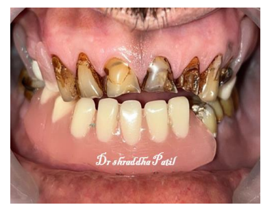
Figure 4: Insertion of RPD

The occlusal vertical dimension and interocclusal rest space (IRS) were recorded. The IRS measured 4-5 mm, which exceeded the normal range of 2-4 mm, indicating sufficient space to increase the OVD. Full mouth rehabilitation was planned, incorporating porcelain-fused-to-