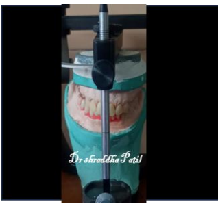
Figure 5: Diagnostic wax up

The occlusal vertical dimension and interocclusal rest space (IRS) were recorded. The IRS measured 4-5 mm, which exceeded the normal range of 2-4 mm, indicating sufficient space to increase the OVD. Full mouth rehabilitation was planned, incorporating porcelain-fused-to-