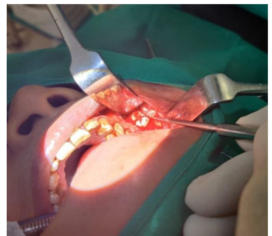
Fig 2- Clinical Photograph of Displaced Tooth

Patient was hospitalized immediately and removal of displaced tooth was planned under general anaesthesia. A vestibular incision was given on left side of maxillary arch extending from first molar till third molar region. Mucoperiosteal flap was Tooth was identified in the raised. infratemporal fossa clinically as well as by comparing with the CBCT images (Fig 2). The tooth was removed only by negative pressure of the suction canula. The site was cleaned by intensive irrigation with saline followed by closure using 3-0 silk suture. Post extraction guidelines were given to the patient. Antibiotics and analgesics were prescribed to the patient to combat post extraction swelling and pain.