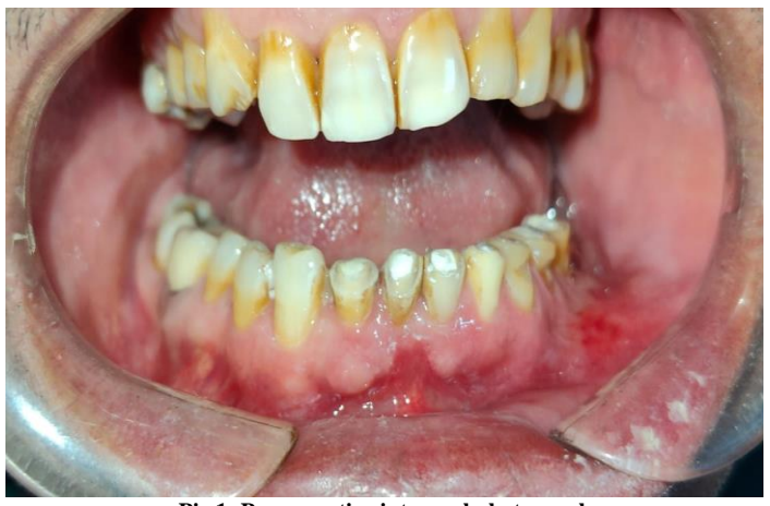
Pic.1- Pre operative intraoral photograph

On intraoral examination, there was generalized attrition of the lower teeth. No other significant findings were identified (Fig.1). Orthopantomogram (OPG) and cone-beam computed tomography (CBCT) was advised for further evaluation.