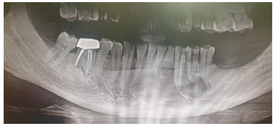
Fig.2- Orthopantomogram revealed a well-defined multi locular radiolucent lesion involving 35 to 43 teeth region.

corticated margin. Effects on surrounding structures include the thinning and resorption of buccal and lingual cortices seen with mild expansion. Knife-edge root resorption in 41, 31, 32, 33, 34, and 35 teeth Loss of cortical borders in focal areas of the superior border of the left inferior alveolar canal (Fig. 3). Radiographic findings were suggestive of a radiolucent osteolytic lesion, likely an ameloblastoma, an odontogenic keratocyst, or a central giant cell granuloma.