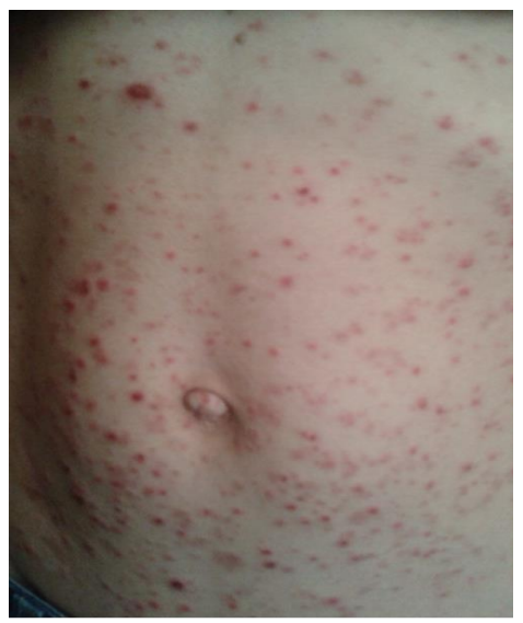
Figure 1: Pre-Treatment Skin Lesions.

diagnosis is to directing successful treatment.