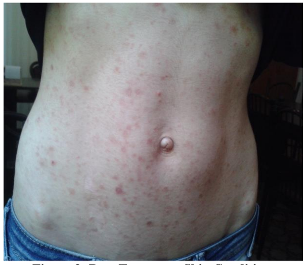
Figure 3: Post-Treatment Skin Condition.