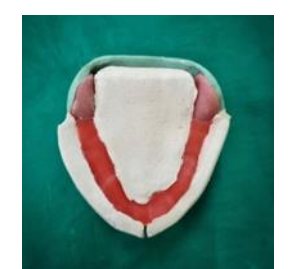
Fig.13 a), b) Fabrication of plaster jig