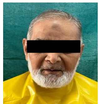
Fig.1 Front Profile

Combining the neutral zone technique with lingualized occlusion presents a synergistic approach to denture fabrication. integration of these methodologies aims to maximize the stability and functional efficiency of dentures, particularly challenging cases involving severe ridge resorption<sup>7-9</sup>.